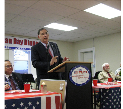
U.S. Sen. John Boozman speaking at the Annual President Reagan Day Dinner